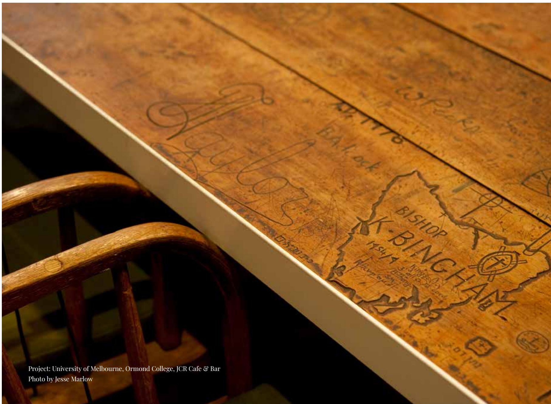
Project: University of Melbourne, Ormond College, JCR Cafe & Bar