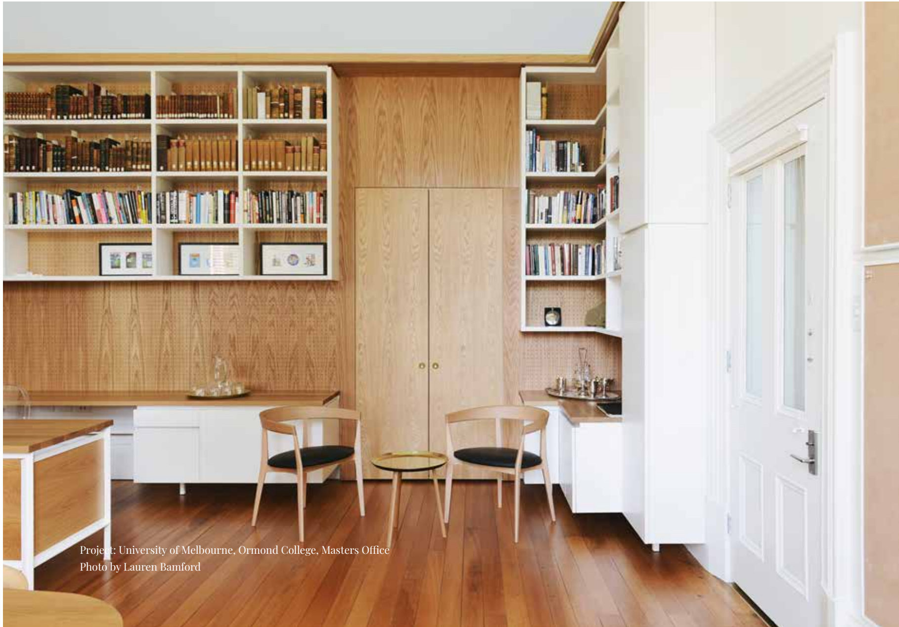
Project: University of Melbourne, Ormond College, Masters Office