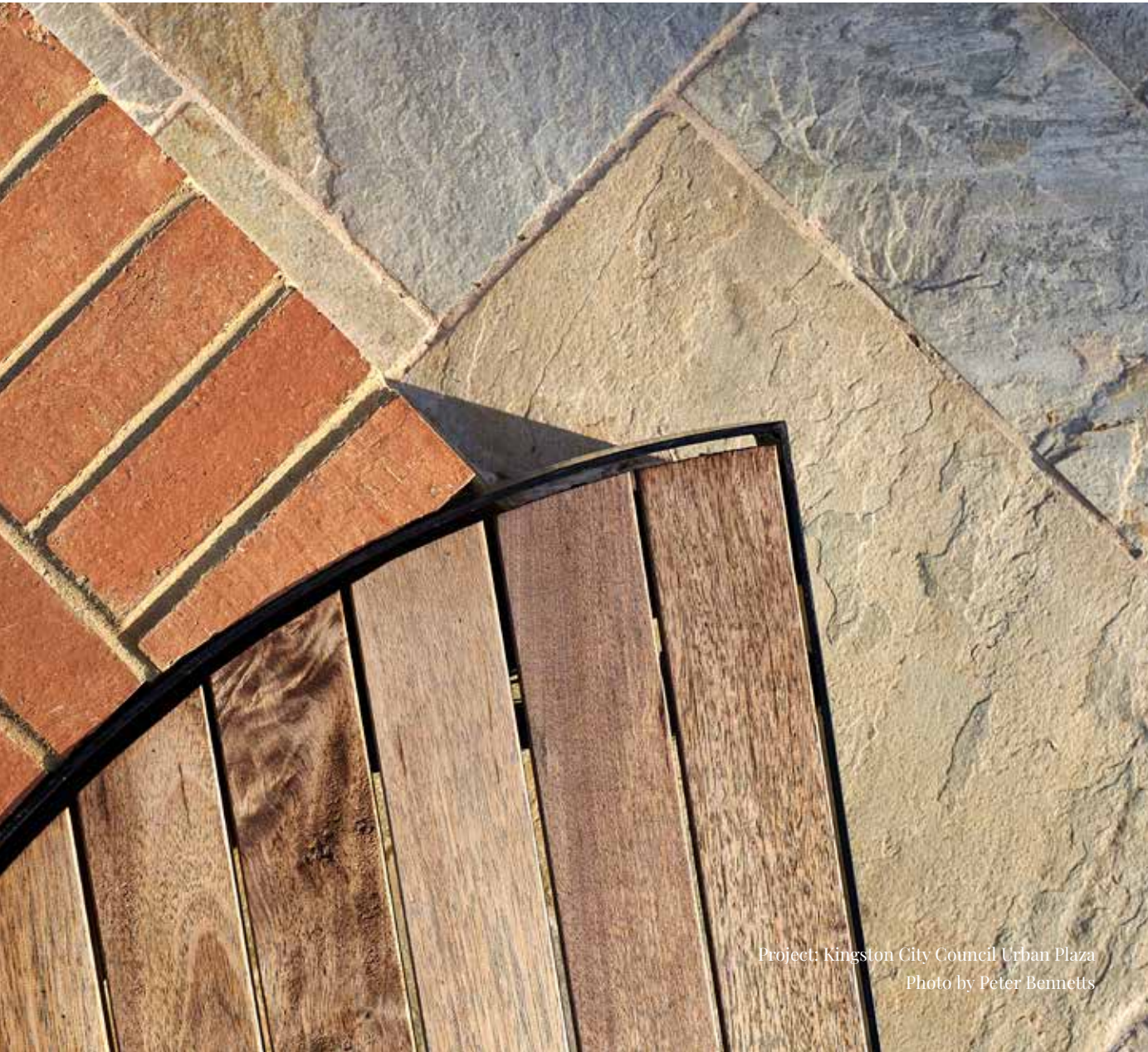
Project: Kingston City Council Urban Plaza

The studio is committed to creating, architecture, interiors, furniture and design projects that start from ‘first principles’ and ends at a place where both the client and architect can be proud.