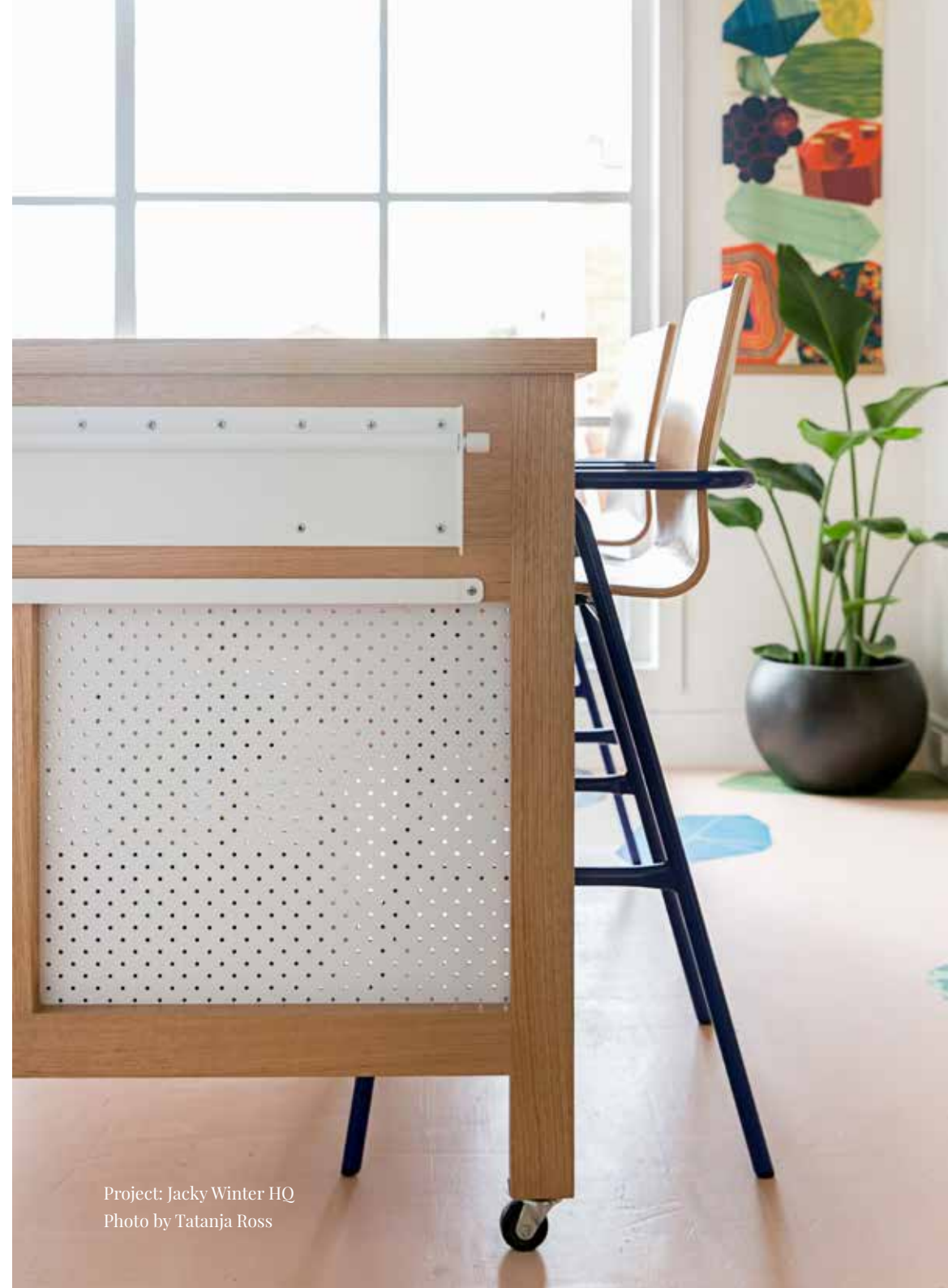
Project: Jacky Winter HQ