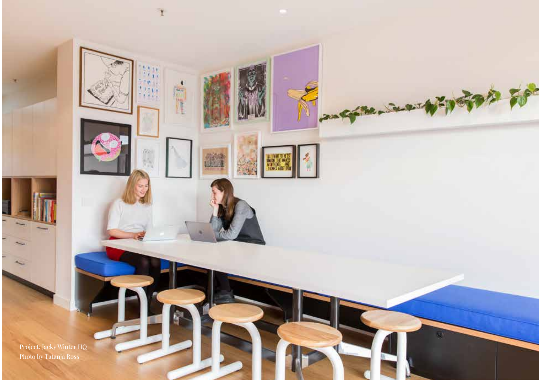
Project: Jacky Winter HQ